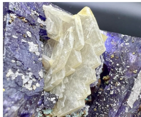
Barite (on fluorite) - Annabel Lee Mine, Illinois