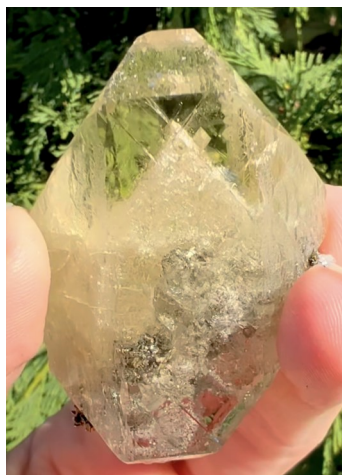
Barite - Linwood Mine, Iowa