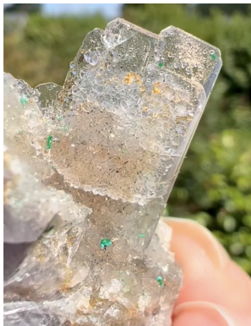
Barite - Tex-Mex Mine, New Mexico