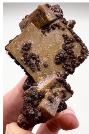
Wulfenite and Endlichite, Los Lamentos Mts., Chihuahua, Mexico