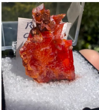
Wulfenite, Red Cloud Mine, Silver Mining District, Arizona, USA

*Send in photos of your own specimens for a chance to have them showcased in the newsletter!