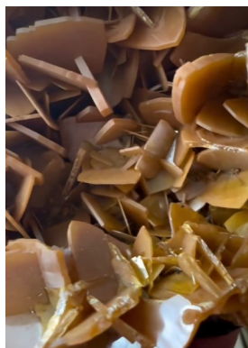
Wulfenite, Defiance Mine, Cochise County, Arizona, USA