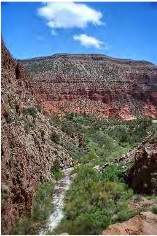
Jemez Mountains.

In an hour, back in traffic As I plan for work and home The pines of Jemez whisper To return and search – alone.