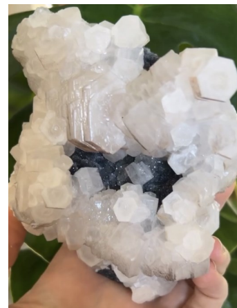
Calcite/Quartz, from Chenzhou, Hunan, China