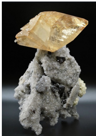
Calcite/Quartz/Sphalerite/ Barite, from Elmwood Mine, Carthage, Smith County, Tennessee, USA