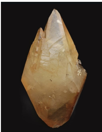
Calcite, from Elmwood Mine, Carthage, Smith County, Tennessee, USA