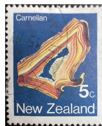
New Zealand Carnelian