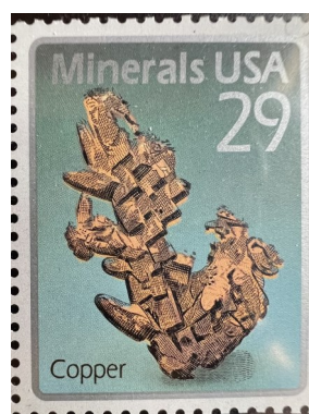
United States Copper