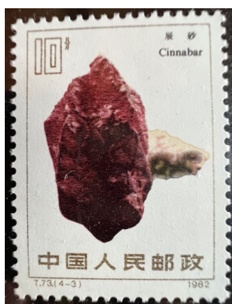
Cinnabar from China