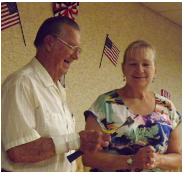
The outgoing President always gets hammered!

Be engaged, stay connected and plan ahead!