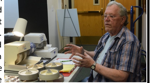
Photo at the Golden Spike Demonstration Meeting