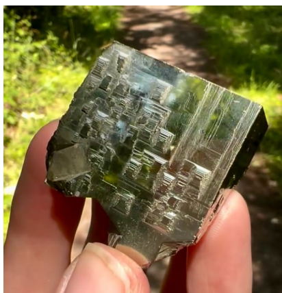
Pyrite - Gold Meyer Hot Springs, King Co., Wa, USA

*Send in photos of your own specimens for a chance to have them showcased in the newsletter!