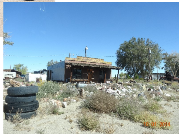
The rock shop